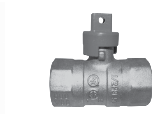
5200S (Square head handle)