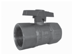
5200T (Tee handle)