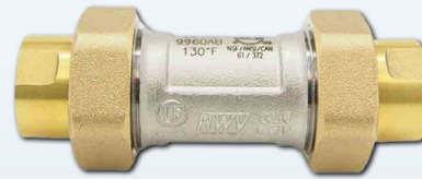
9960ABT-FF FNPT x FNPT