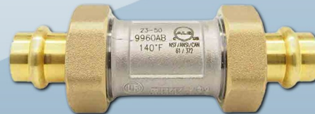
9960ABT-PP EzPress x EzPress