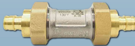
9960ABT-EE PEX F-1960 x PEX F-1960