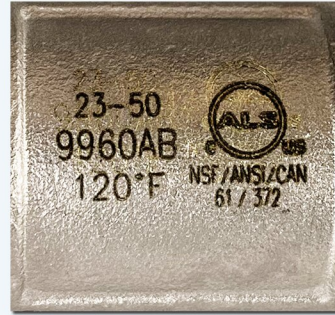
Design Temperature Listed On Valve Body