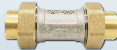
9960ABT-SS Solder x Solder